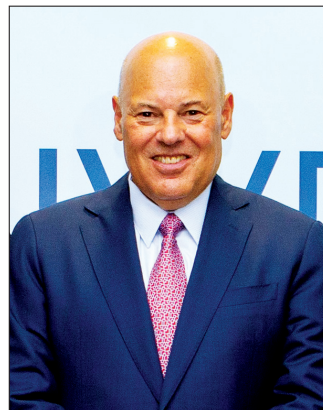
Louis DeJoy, Postmaster General

SPOTLIGHT ON BOSTON THE POSTMASTER GENERAL IS COMING TO BOSTON NATIONAL PCC DAY WITH THE PMG WEDNESDAY, SEPTEMBER 20, 2023