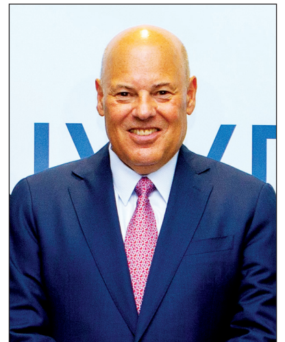
Louis DeJoy, Postmaster General

For more information about the Greater Boston PCC, visit us at: www.bostonpcc.org